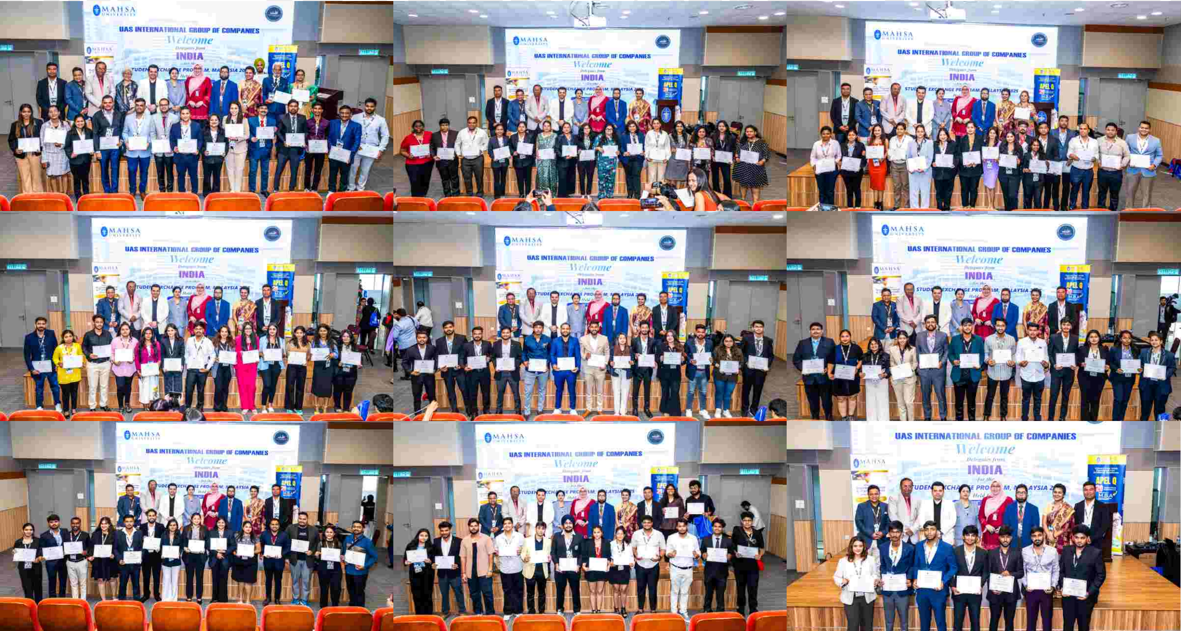
STUDENT EXCHANGE PROGRAM - MALAYSIA ( 16 th February 2025 to 22 nd February 2025 )