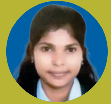
Kajal Walmik APS Microtech