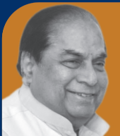
Dr. D. Y. Patil Founder President